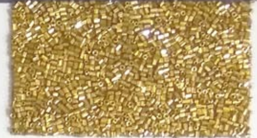
BEADS 14/0 GOLD STK