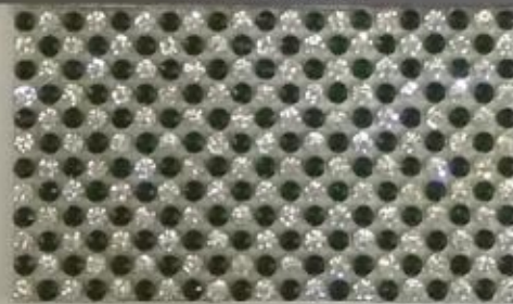
SS12 EX - BRILLIANT SHEET IN 1 + 1 COLOUR