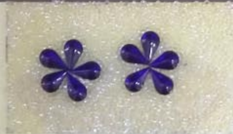
10 x 6 PEARS WITH 1.2 MM BALL