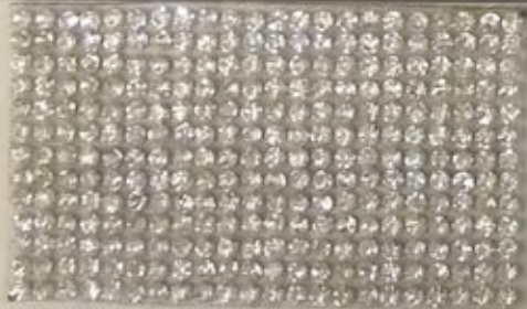
MC CHATON SHEET SS12