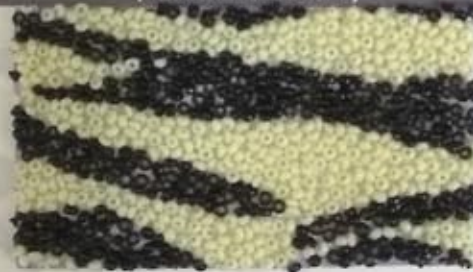
13/0 BEADS IN TWO COLOUR (ZIG ZAG LINE SHAPE)