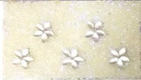
6 x 3 NAVETTE WITH 1.2 MM BALL